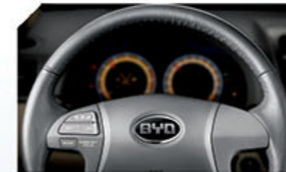
STEERING WHEEL WITH AUDIO CONTROLS (FOR GS-i DCT ONLY)