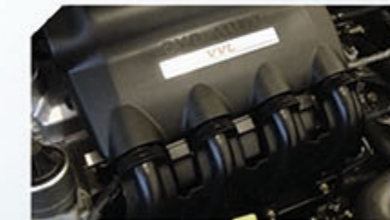
16V SOHC ROBUST AND HIGHLY EFFICIENT ENGINE