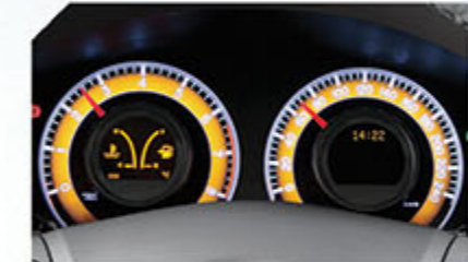
LED MULTI-FUNCTION INSTRUMENT PANEL WITH TRIP COMPUTER