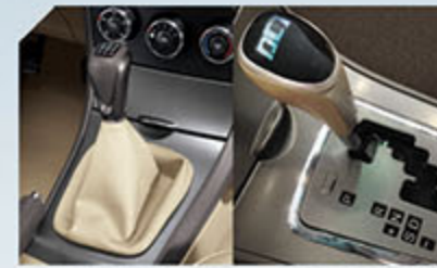
5-SPEED MANUAL TRANSMISSION DUAL CLUTCH TRANSMISSION

1. Solar Transport and Automotive Resources Corporation reserves the right to alter any specification without prior notice. 2. Photos shown in this brochure may vary from actual unit.