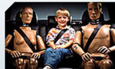
THREE-POINT SEAT BELTS & ISOFIX