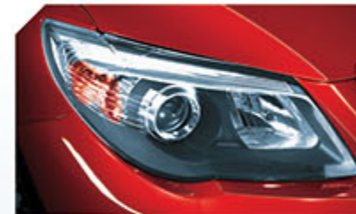
PROJECTOR-TYPE HALOGEN HEADLIGHTS