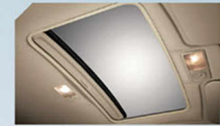
POWER SLIDING SUNROOF (FOR GS-i DCT ONLY)