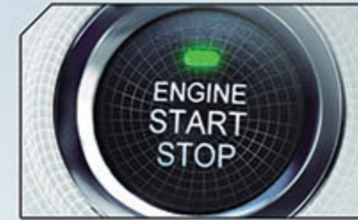
ENGINE PUSH START/STOP WITH KEYLESS ENTRY