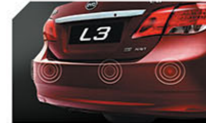
REAR PARKING RADARS (FOR GS-i DCT ONLY)