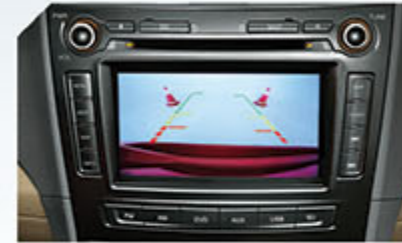
7" TOUCH SCREEN MONITOR WITH AM/FM, CD, DVD, AUX, USB, SD CARD AND REVERSE IMAGING SYSTEM (FOR GS-i DCT ONLY)